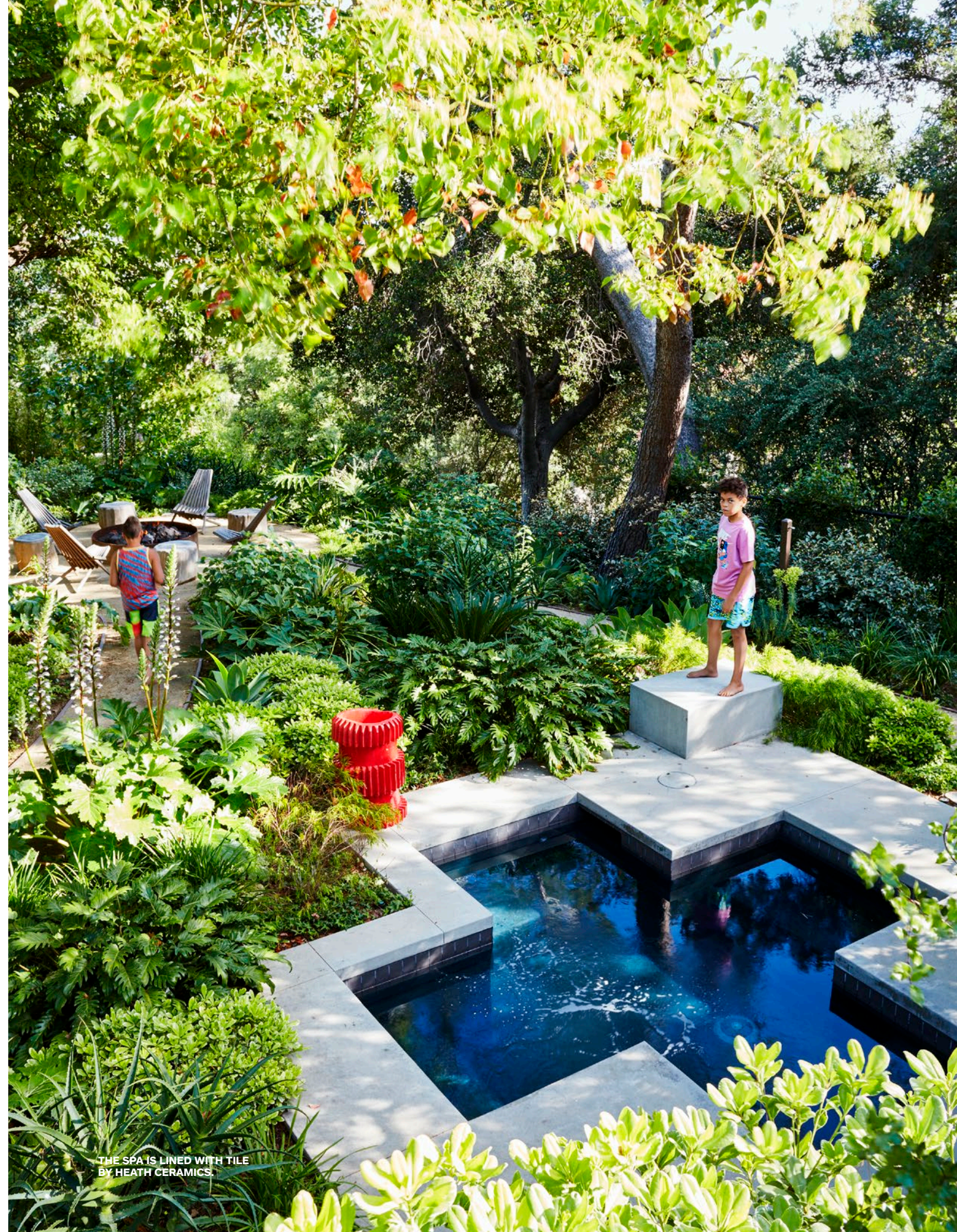
THE SPA IS LINED WITH TILE BY HEATH CERAMICS.

JEFFREY GIBSON. WILLIAM BRICKEL. © 2020 FRANK STELLA/ARTISTS RIGHTS SOCIETY (ARS), NEW YORK.