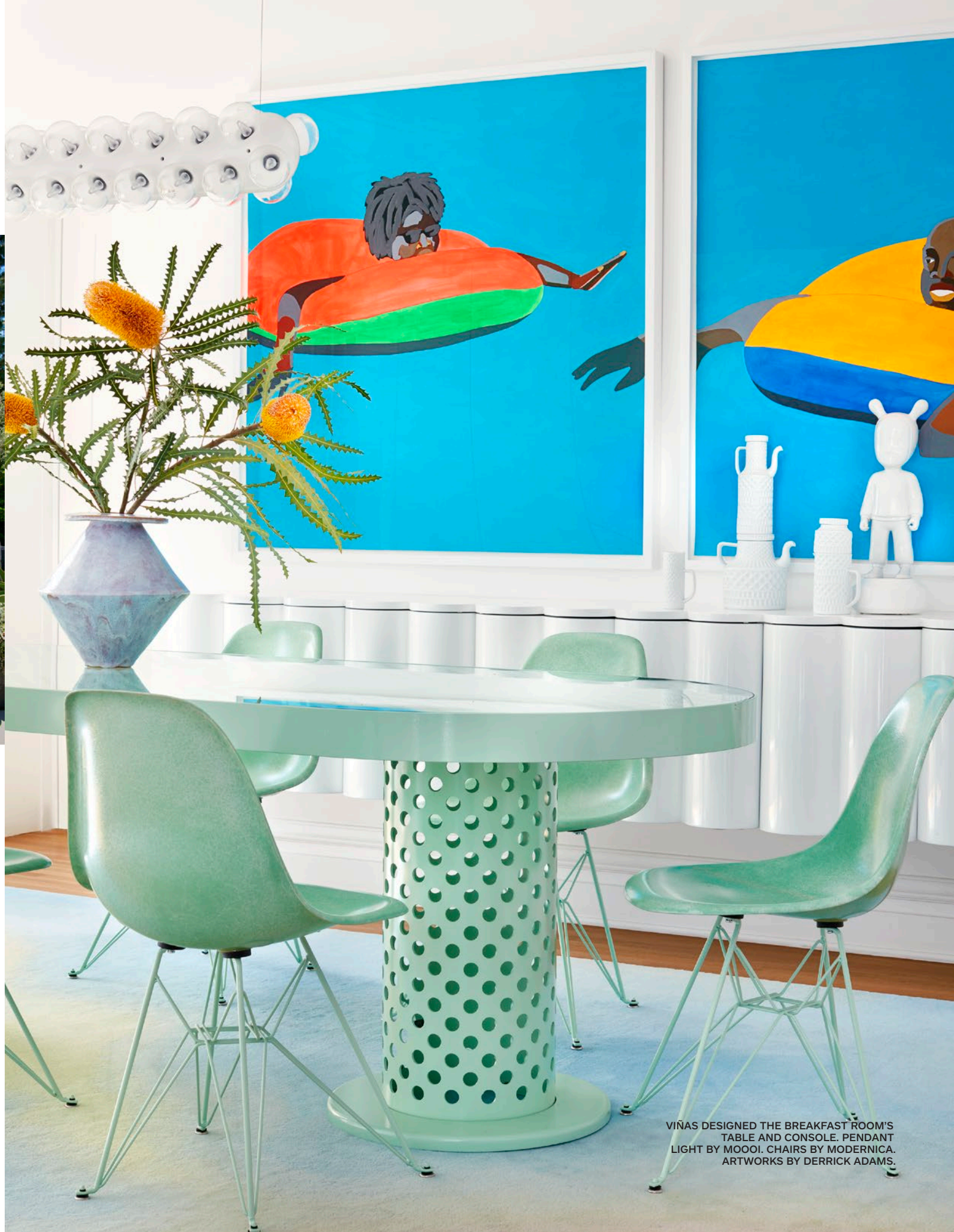
VIÑAS DESIGNED THE BREAKFAST ROOM'S TABLE AND CONSOLE. PENDANT LIGHT BY MOOOI. CHAIRS BY MODERNICA. ARTWORKS BY DERRICK ADAMS.