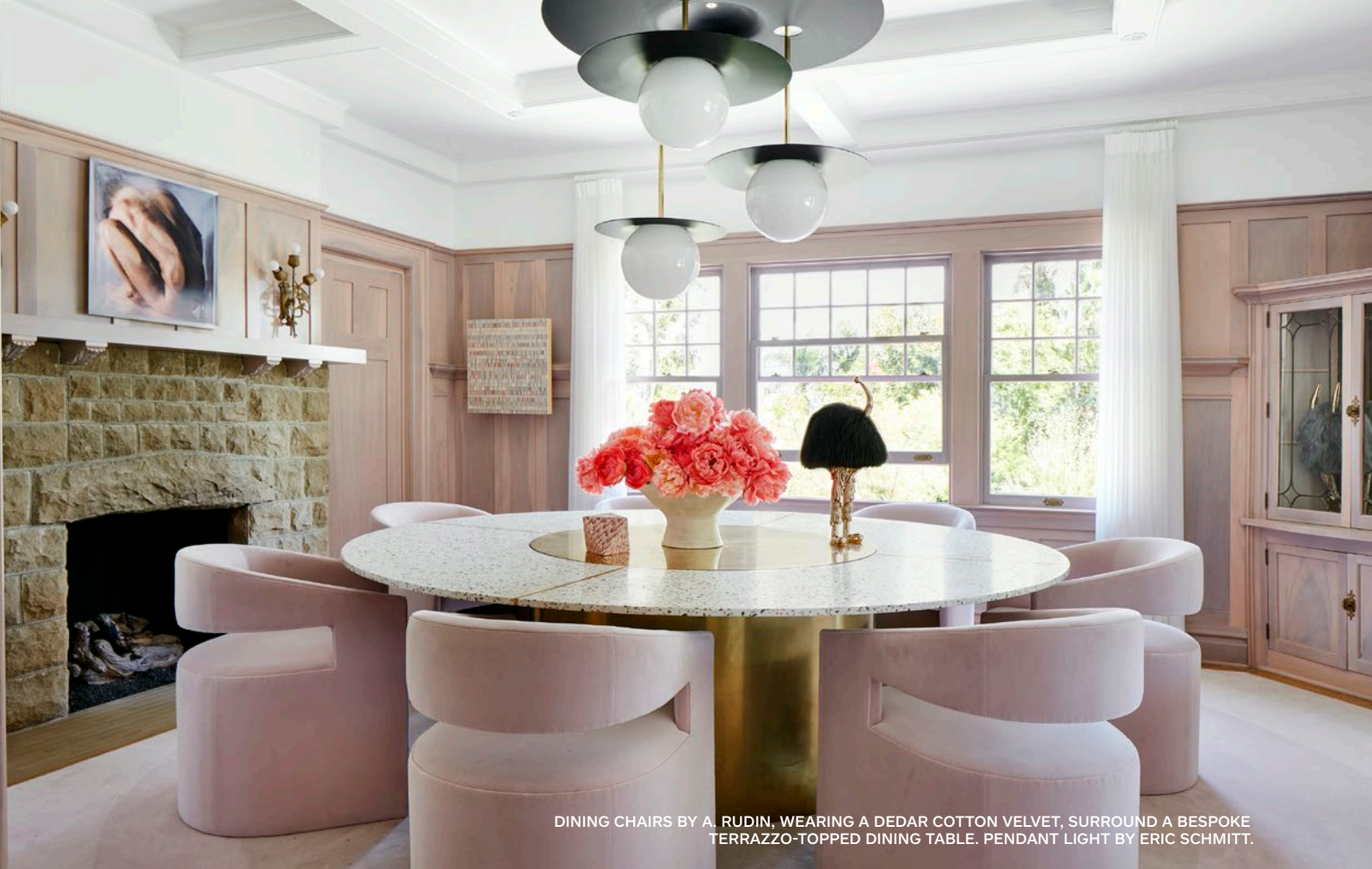
DINING CHAIRS BY A. RUDIN, WEARING A DEDAR COTTON VELVET, SURROUND A BESPOKE TERRAZZO-TOPPED DINING TABLE. PENDANT LIGHT BY ERIC SCHMITT.

Cummings, an L.A. businessman and real estate developer, built the place. On the plus side, most of the architectural details and woodwork were intact, albeit damaged (a bonus for interior designer Ghislaine Viñas), and the property boasted an array of mature eucalyptus, pine, palm, mulberry, and olive trees (a jackpot for landscape designer Judy Kameon). On the minus side, the structure needed a proper foundation—it sat on an eroded stacked-stone base planted on a patch of dirt—as well as serious structural reinforcement, completely new mechanical systems, the replacement of inelegant '70s-era aluminum windows and chintzy wrought-iron railings, and the reinvention of the kitchen and baths.